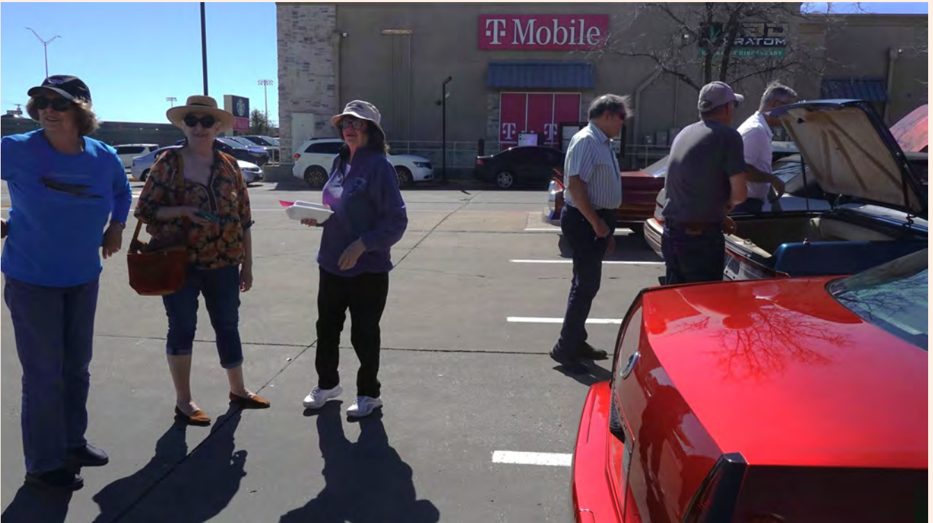
The girls enjoying socializing and the boy's only interest is these fine cars.