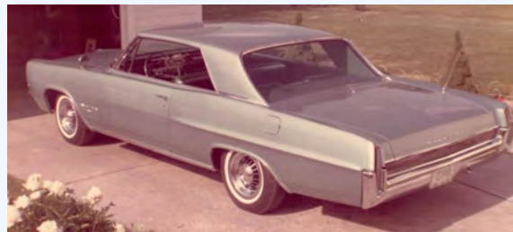
I bought this new 1964 Grand Prix with exclusive eight lug wheels 1960-1968.