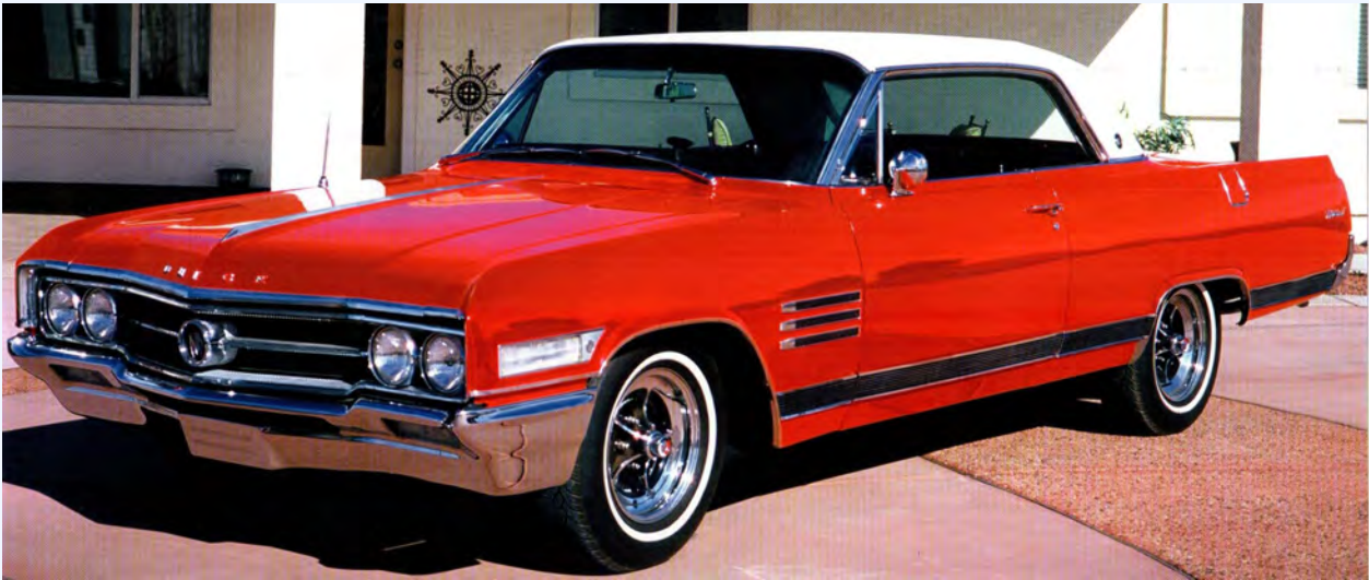
Exclusive, only Buick, are the gorgeous 15” chrome sport wheels - new 1964 Wildcat.