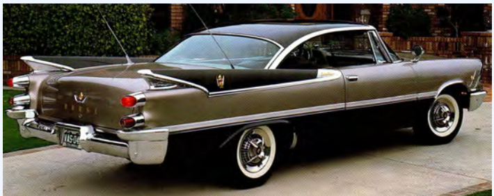
1958 and 1959 Dodge royal lancer spinners won the hearts of real car cruisers nationwide customizers.