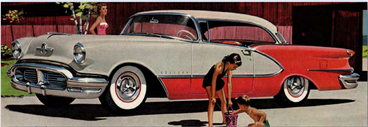
1956 Oldsmobile featured the coolest most duplicated spinner wheel covers in history!